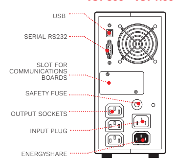
VST 1500 - VST 2000